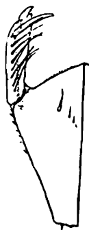
FIG. 1.—Mask of larval form of Ceragrion coromandelianum (Fabr.).

distal half. On either side of the middle line is an oblique row of 5 setae, diverging distally; the outermost being by far the largest. Anterior margin of mask bluntly angular. The palpi each bear 7 long setae in addition to the moveable hook (see fig. 1). The length of each of the middle pair of legs is about 7 mm.