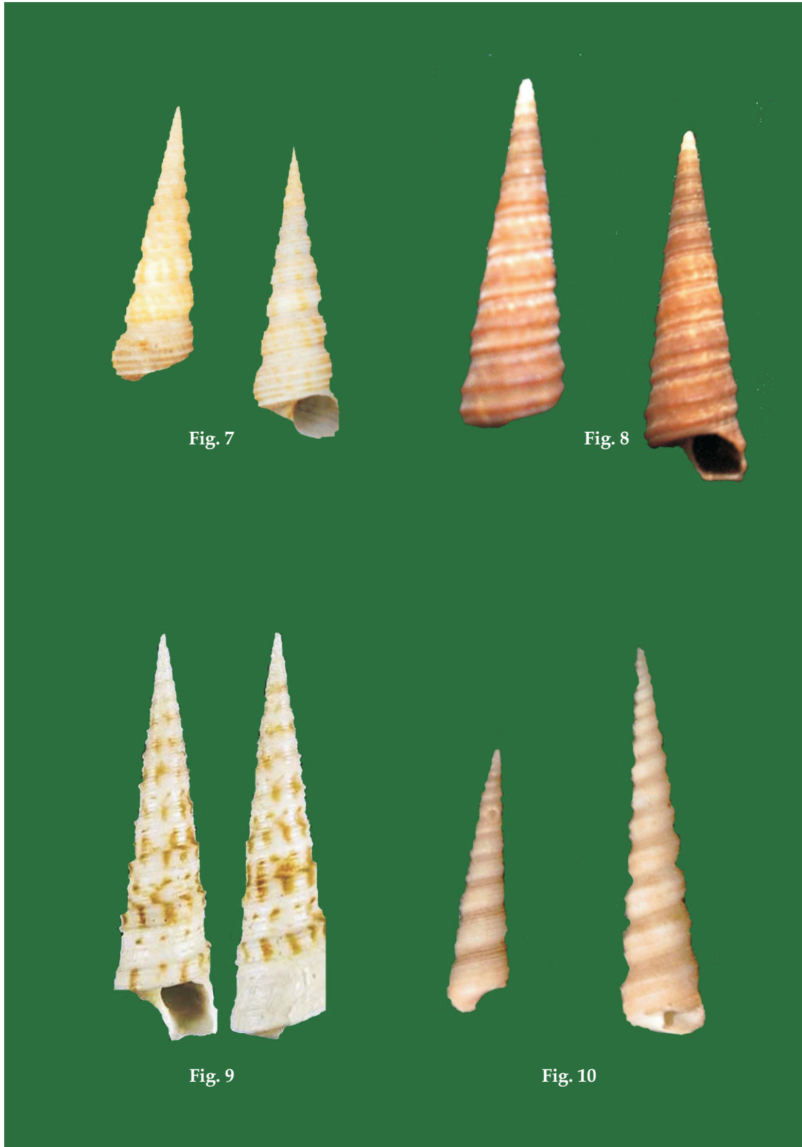
Fig. : 7. Turritella fultoni Melvill; Fig. 8. Haustator trisulcata (Lamarck); Fig. 9. Turritella monilifera Adam & Reeve; Fig. 10. Turritella fastigiata Adam & Reeve.