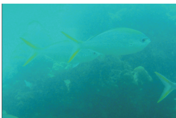
Caesio cuning (Bloch 1791) (underwater photo)