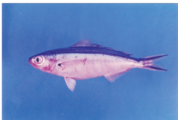
Pterocaesio tile (Cuvier, 1830)