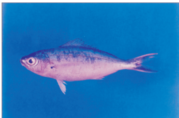
Caesio caerulaurea Lacepede, 1801