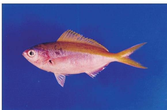
Caesio xanthonota (Bleeker, 1845)