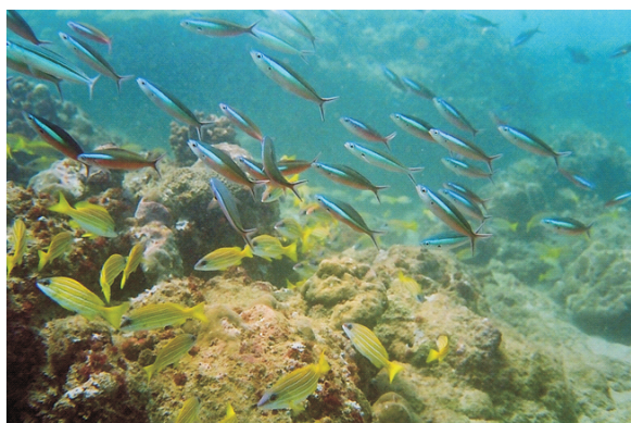
Pterocaesio tile (Cuvier, 1830) (underwater photo)