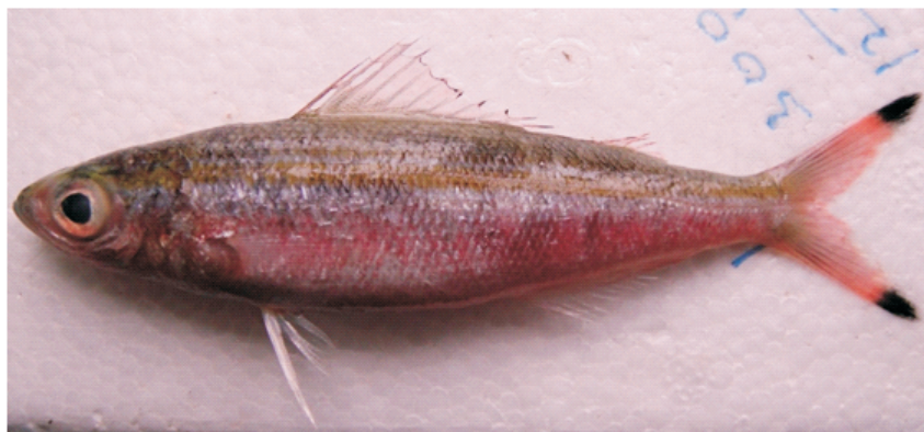
Pterocaesio trilineata Carpenter, 1987