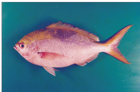
Caesio cuning (Bloch, 1791)