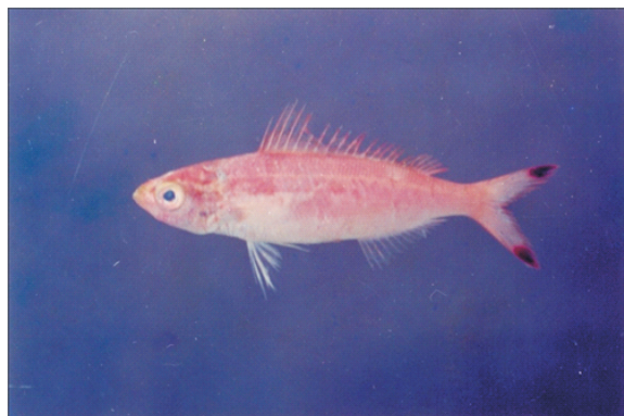
Pterocaesio pisang (Bleeker, 1853)