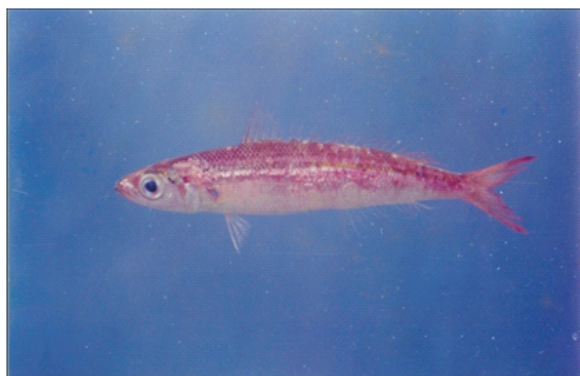
Gymnocaesio gymnoptera (Bleeker, 1856)