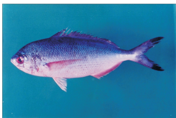
Caesio lunaris Cuvier, 1830