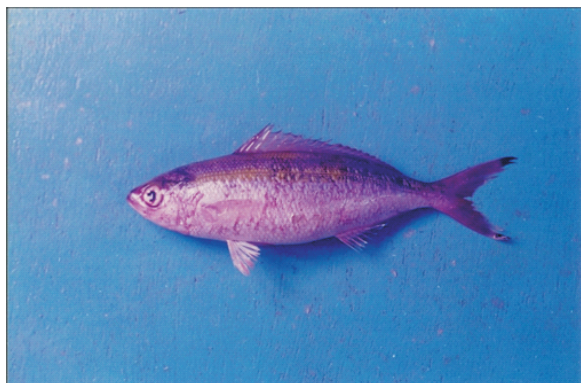
Pterocaesio marri Schultz, 1953