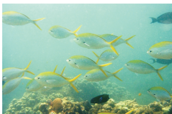
Caesio xanthonota (Bleeker, 1845) (underwater photo)