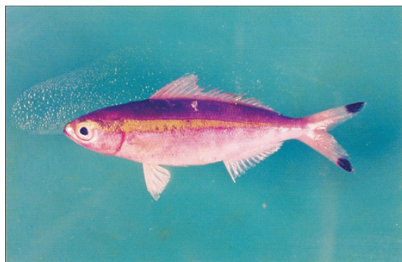
Pterocaesio chrysozona (Cuvier, 1830)